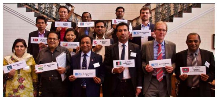
Working Group Participants and facilitators - Metrology