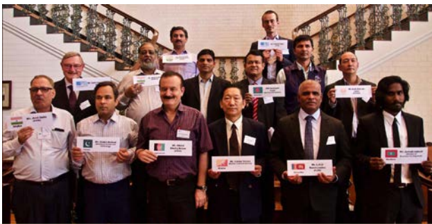
Working Group Participants and facilitators - Accreditation