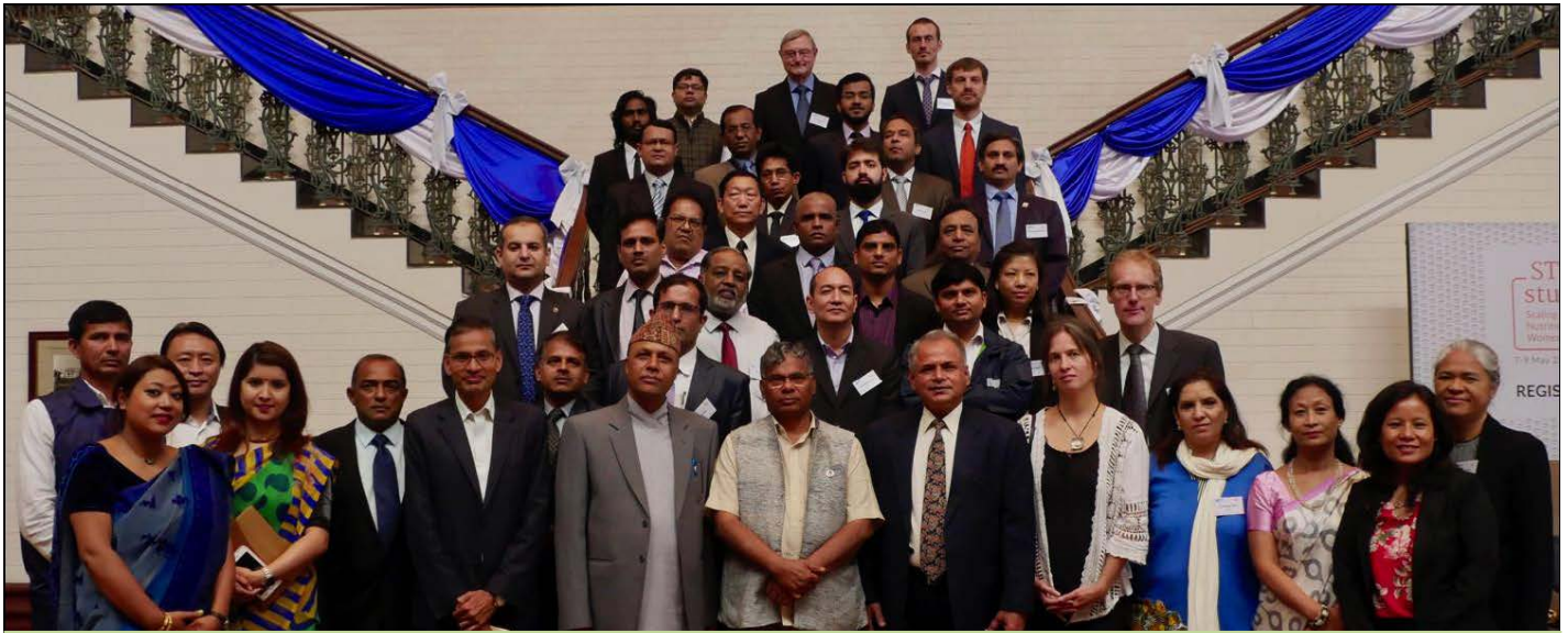
Delegates of the SAARC Member States with the Honorable Guests

The Regional kick-off workshop of the project phase 3 (2018-2021) under the SAARC-PTB Project 'Strengthening regional integration and cooperation in the field of quality infrastructure in South Asia', was held from 08 to 09 May 2018 in Kathmandu, Nepal. The workshop was held under the financial assistance of PTB-Germany and hosted by Nepal Bureau of Standards and Metrology (NBSM), Nepal. The regional kick-off workshop was aimed to familiarize major project partners with the intervention, logic and expected outputs of the project; to discuss, plan and